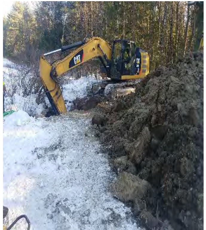
Fig 20: Excavating foundation for Str. 70. Viewing east. (01-22-20).