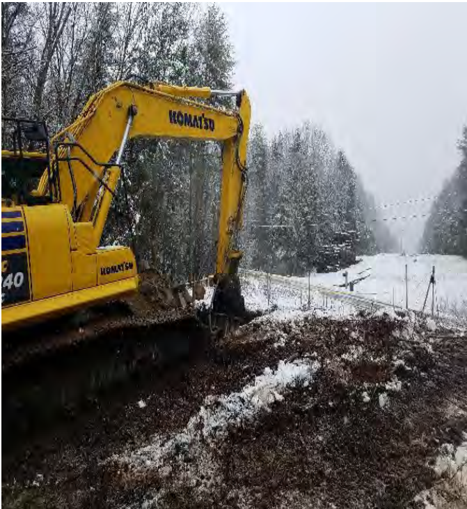
Fig 3: Excavating foundation for Str. 72. Viewing northeast. (01-16-20).