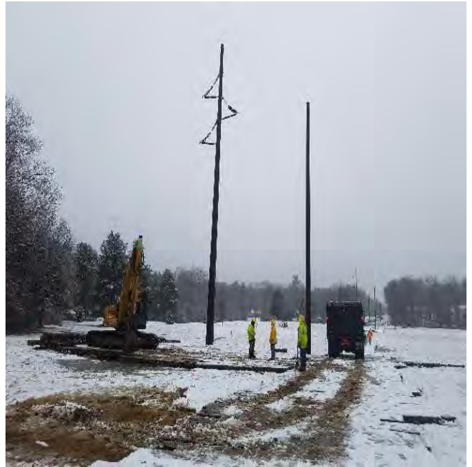
Fig 2: Str. 111. Viewing south. (01-16-20).