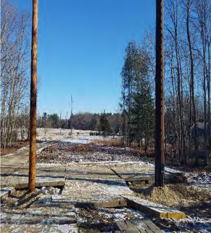
Fig 9: Str. 109. In wetland NW26. Viewing northeast. (01-17-20).