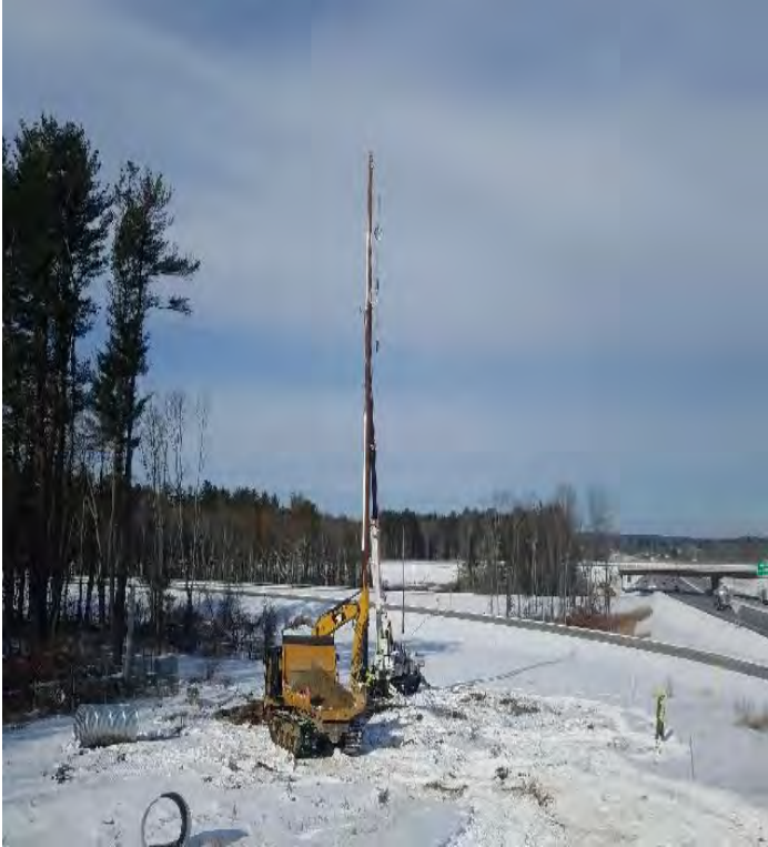
Fig 13: Crew installing Str. 119. Viewing northwest. (01-21-20).