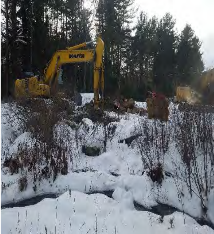
Fig 17: Excavating foundation for Str. 70. Viewing west. (01-21-20).