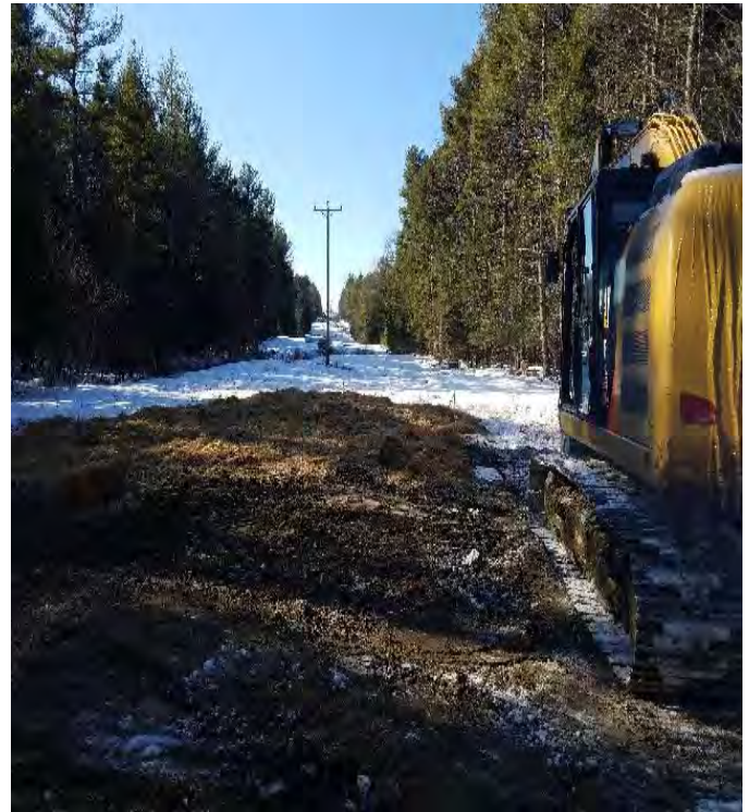
Fig 10: Spreading straw over exposed soil around Str. 71 foundation cans. Viewing west. (01-20-20).