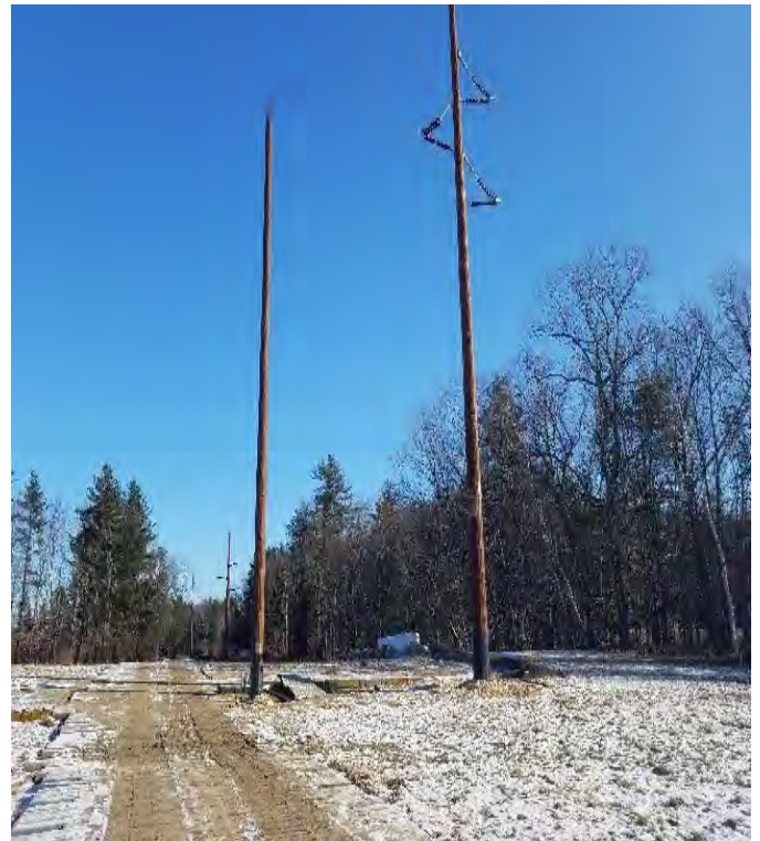
Fig 8: Str. 111. Viewing northeast. (01-17-20).