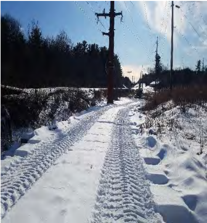
Fig 15: Str. 2. Viewing south. (01-21-20).