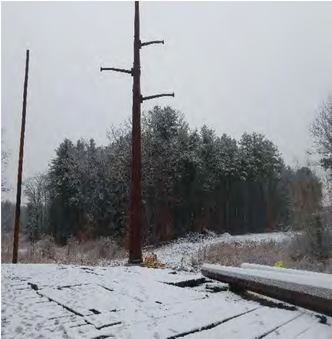
Fig 1: Str. 112. Viewing northeast. (01-16-20).