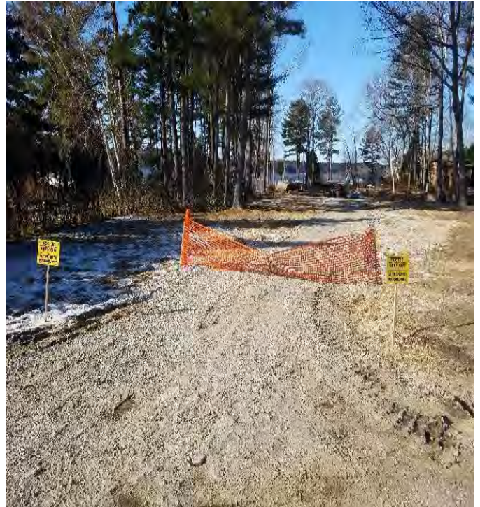
Fig 4: Access road entrance to Gundalow landing/east side of the Bay. (01-17-20).