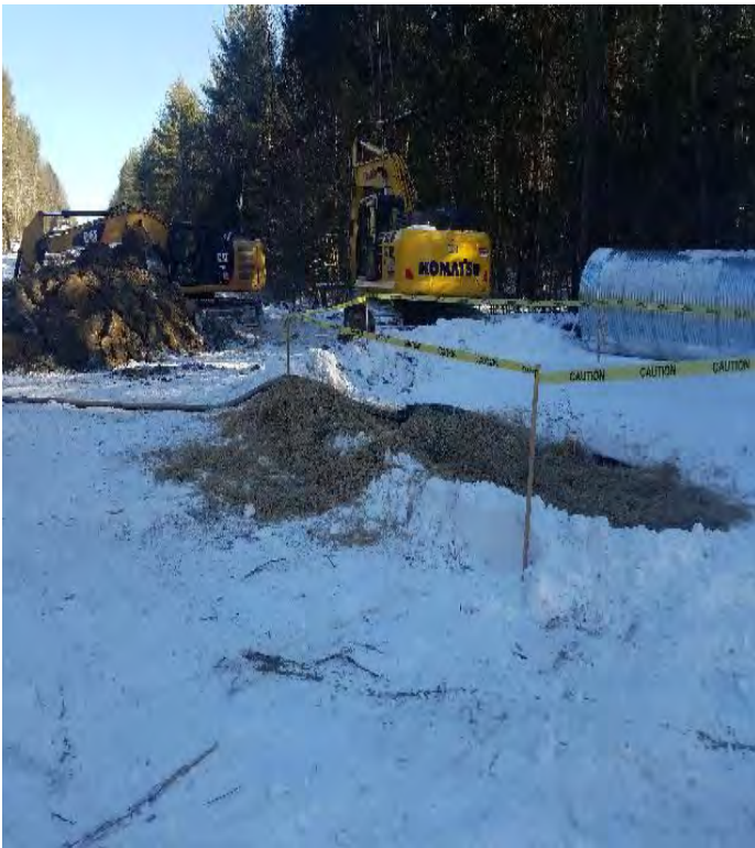
Fig 19: Dewatering basin at Str. 70. Viewing east. (01-22-20).