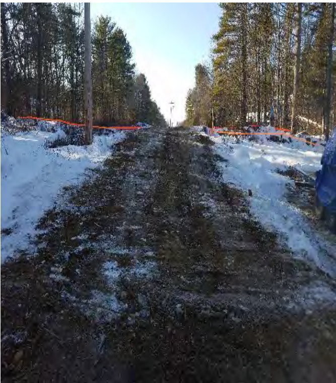
Fig 11: Timber bridge over stonewall WP-21. Viewing west. (01-20-20).