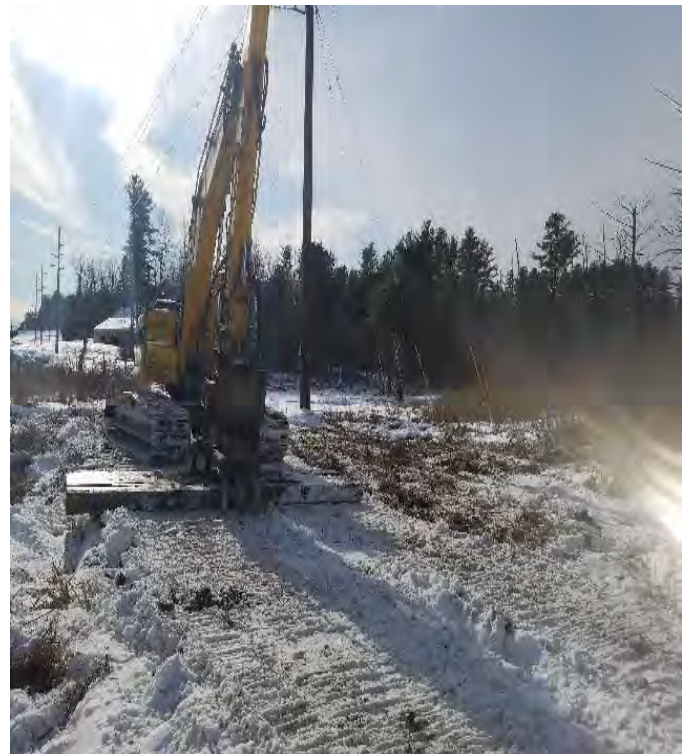
Fig 16: Removing timber mats around Str. 3. Viewing south. (01-21-20).