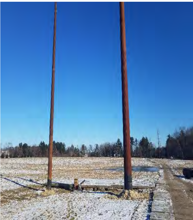
Fig 7: Str. 110. Viewing northeast. (01-17-20).