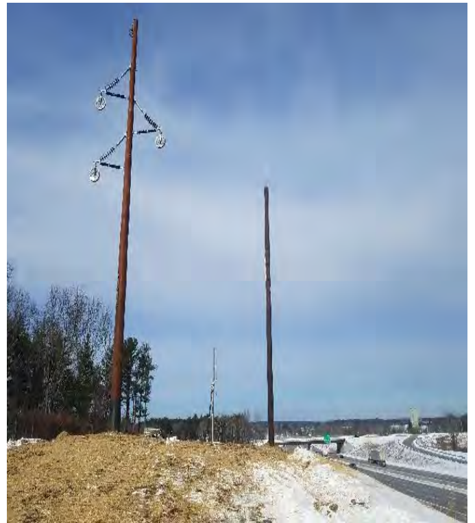
Fig 14: Str. 120. Viewing north. (01-21-20).