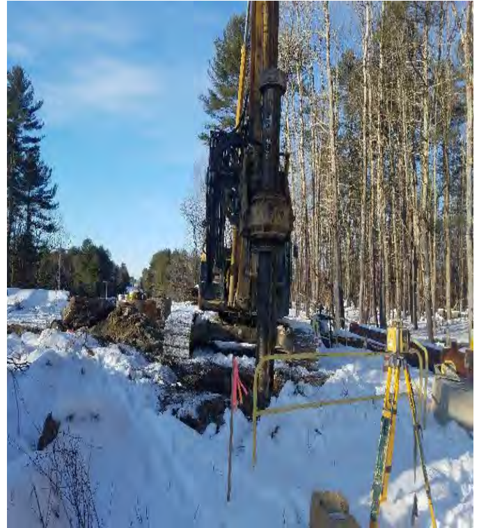
Fig 12: MJ drilling foundation for Str. 58. Viewing west. (01-21-20).