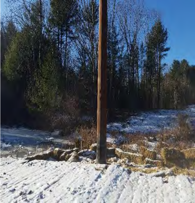
Fig 5: Str. 102. Viewing southwest in wetland NW6. (01-17-20). Straw bales have since been staked in.