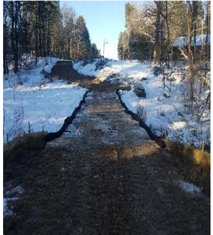
Fig 18: Access road through wetland DW9. Viewing west. (01-22-20).